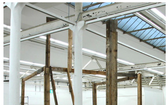
Zurich | Switzerland | Shedhalle