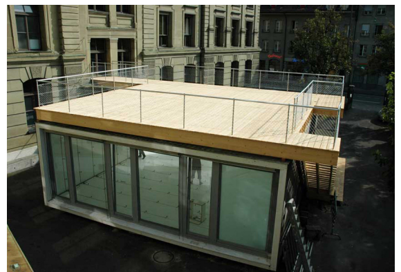
Bern | Switzerland | City Gallery (Loge)