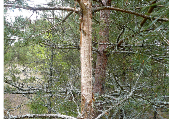
Nida | Lithuania | Nida Art Colony