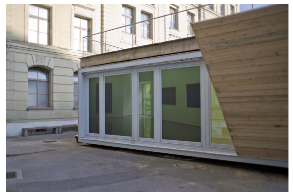
Bern | Switzerland | City Gallery (Loge)

Adrien Tirtiaux's exhibition raised questions about the public sphere and uses the open architecture of the City Gallery as a starting point. This led him to open up the space, which had been closed by Heinrich Gartentor and transform it back into what we think of as a public space, a space with nature, social attitude and political control. The exhibition becomes „public“. He includes the material pinewood laths in his production, which the artist Gartentor also used in his exhibition landscape. He allows the wall