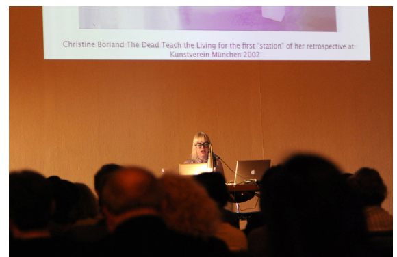
Kassel | Germany | Kunsthalle Fridericanum Kassel